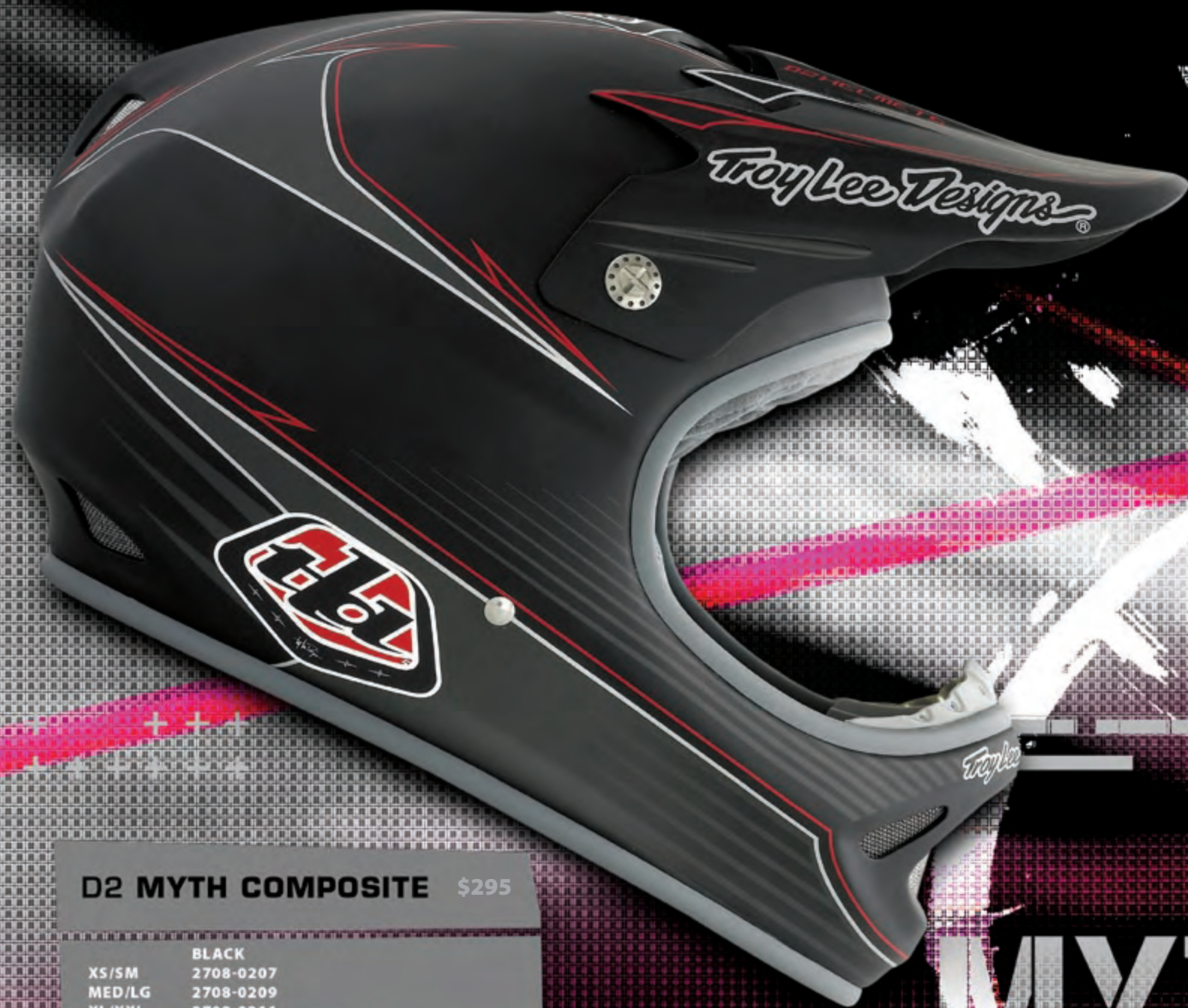
D2 MYTH COMPOSITE $295